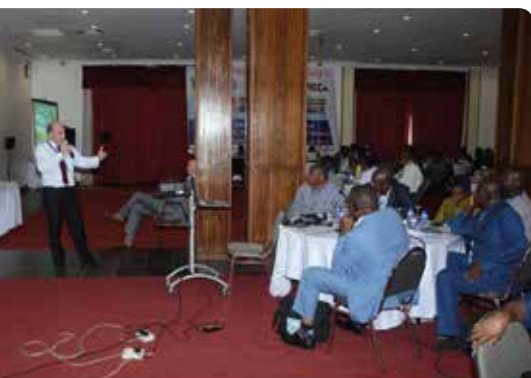
IMO/IPIECA GI WACAF Regional Conference, Accra, Ghana