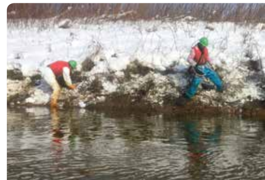
Heavy snow fall made for difficult working conditions during the CITY response

Whilst the number of new incidents that ITOPF attends remains more or less constant from year to year, the complexity and duration of the issues arising mean that ITOPF's staff are sometimes engaged in the monitoring and assessment of pollution damage for many months, even years afterwards. By way of example, this year ITOPF was asked to provide technical advice in relation to allegations that drinking water aquifers were contaminated with oil from an incident occurring some 16 years earlier. More often than not the issues arising relate to claims for environmental damage. Some of these claims can run into many $millions and lack the evidence to support damage of this magnitude. Other claims are more difficult to assess because of the scale of the incident or the lack of official documents to prove loss. This is especially the case for artisanal fisheries where records are rarely kept yet financial loss has clearly arisen, such as in the case of the MT GOLDEN MILLER where the team is still involved in assessing fisheries claims following the incident in December 2013. It