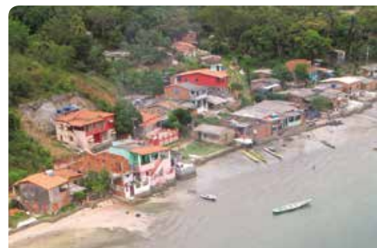
ITOPF continues to be involved in assessing fisheries claims following the GOLDEN MILLER incident

Another valuable mechanism that ITOPF uses to disseminate lessons learned is through its contribution to intergovernmental fora and industry-government partnerships, such as the International Maritime Organisation (IMO), International Oil Pollution Compensation Fund (IOPC Fund), IMO-IPIECA Global Initiative programmes, and others. The team has worked with the IOPC Fund to draft two key guidance documents for potential claimants following oil spills. These were published during the year: 'Guidelines for presenting claims for clean-up and preventative measures' and 'Guidelines for presenting claims in the fisheries, mariculture and fish processing sector' . Such publications, together with ITOPF's own publications, serve as references to best practice based on first-hand experience.