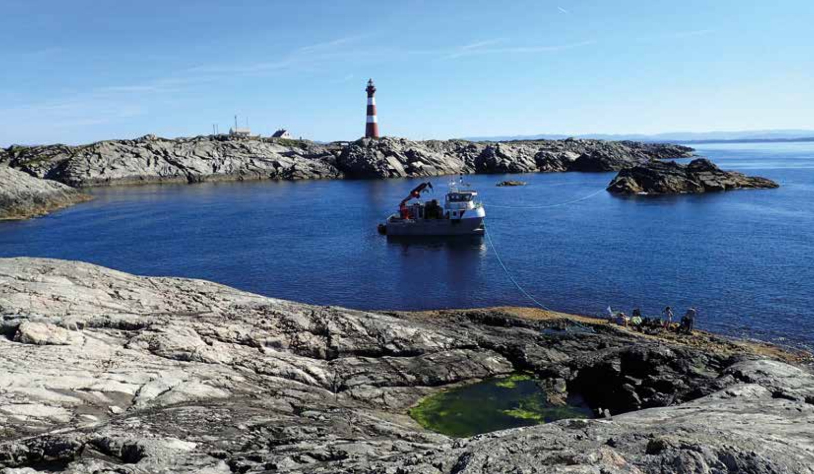
Site survey in Norway to assess potential environmental impacts of a wreck