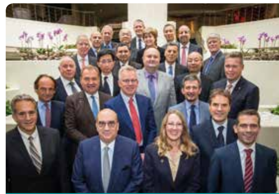
The ITOPF Board, November 2015

With a focus on staff retention, all roles were salary benchmarked during the year and job-descriptions were updated. In addition, work is almost complete to update ITOPF's internal HR policies. In my Statement last year I alluded to the challenges facing a small organisation when seeking to apply flexible working practices for staff with young families whilst needing to maintain 24/7 capability in case of incidents. I am pleased that the Federation has demonstrated its adaptability by providing enhanced maternity/paternity benefits and the possibility of Senior Technical