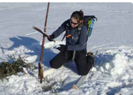
Preparing for spills in cold climates at an Arctic survival course

Advisers taking a secondment as a non-emergency responder. These will continue to be challenges in a small organisation but we trust this approach will go some way to retaining experienced staff.