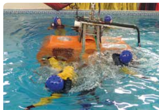
The technical team undertaking helicopter underwater escape training