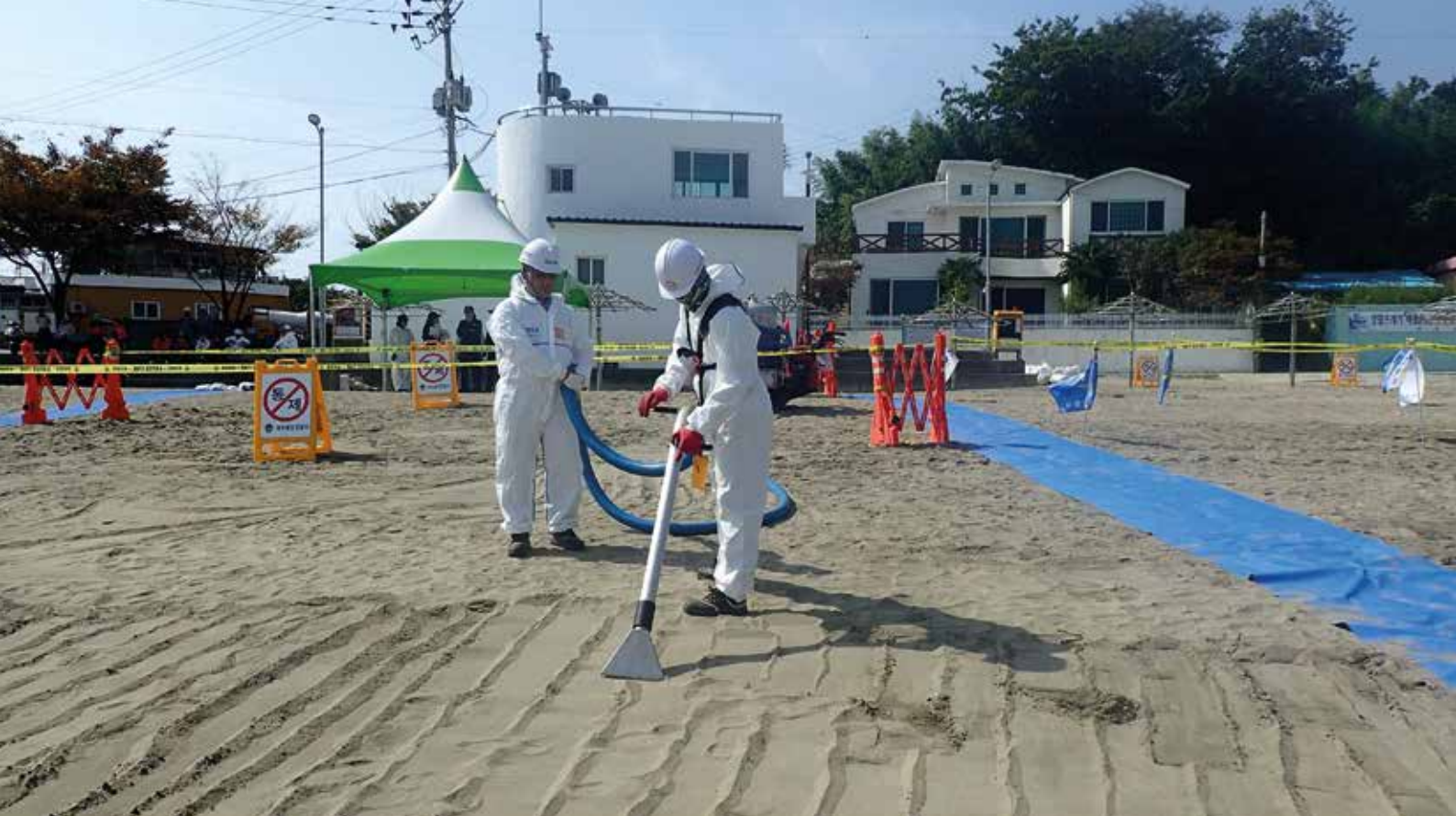
ITOPF supported an exercise run by the Korea Coast Guard