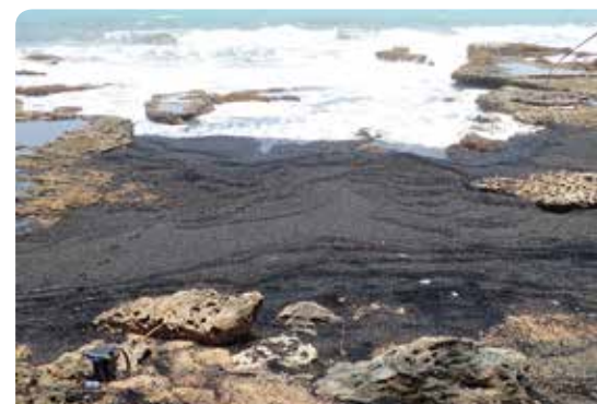
Bituminous coal stranded on the coastline of Indonesia