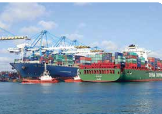
Shipowners need to think 'outside the box' to achieve excellence

One of the larger incidents that ITOPF attended involved the loss of bunkers when the MV CITY broke up after running aground in Japan. A combination of heavy snowfall and oil having penetrated a network of highly valued paddy fields meant that Technical Advisers were on site continuously for 8 weeks. During that time they established a good