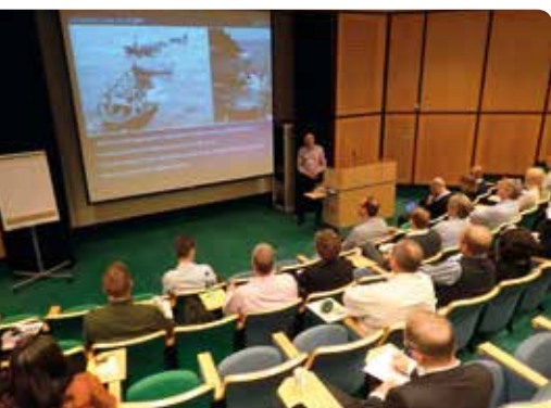
ITOPF presenting at a seminar for Gard P&I Club

Throughout the year the team has continued its work to raise awareness of the services the Federation provides, in 'peace-time' as well as in an emergency, amongst shipowners and their insurers. This involved meeting shipowners and ship-managers at their offices around the world, contributing to P&I 'Member Days', attending shipowner conferences and events, and meeting ship's crews on-board their vessels. Maersk Tankers kindly provided an opportunity for a Technical Adviser to join them on a voyage in Europe. This afforded the chance to discuss emergency response drills and training with the Captain and crew and had the reciprocal benefit of enabling ITOPF to observe the important procedures that are followed when loading, transporting and discharging oil.