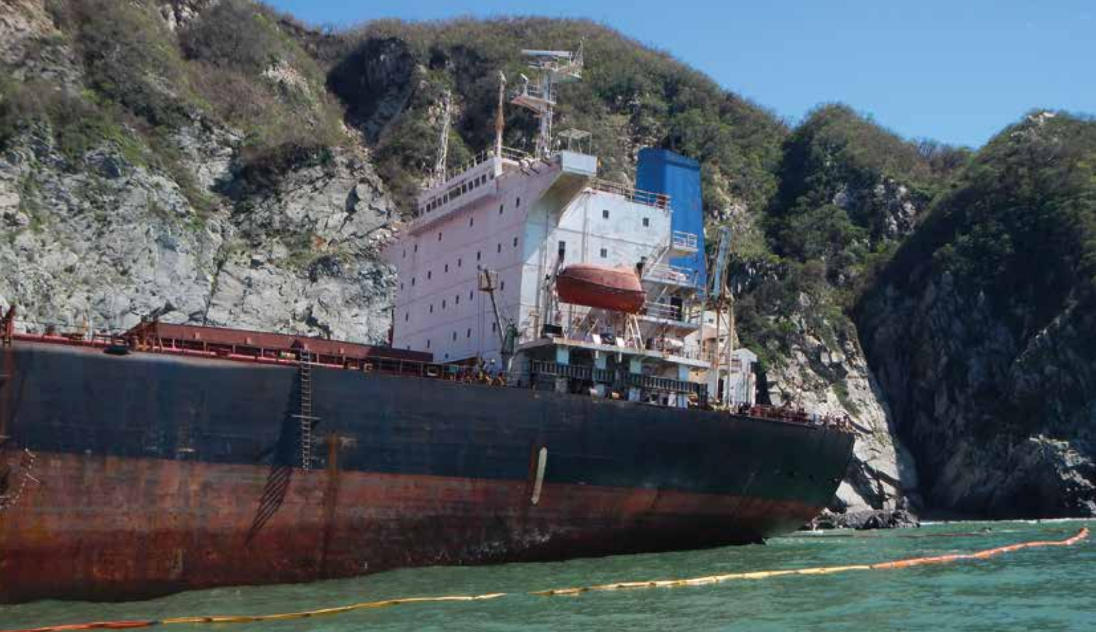
ITOPF provided advice on wreck removal and associated environmental issues in the case of MV LOS LLANITOS

is in cases such as these when shipowners, their insurers and claimants rely heavily upon ITOPF, both to provide that all-important technical objectivity and to identify ways to assess claims fairly.