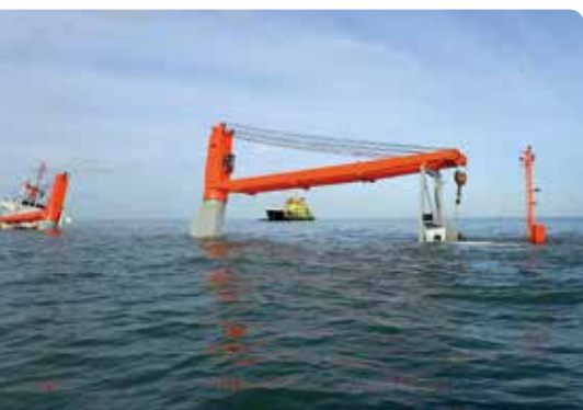
ITOPF has attended 20 new incidents during the year under review