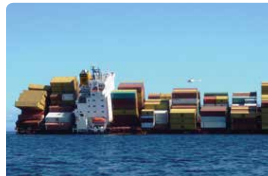
ITOPF peer reviewed a plan developed by Maritime New Zealand after the RENA incident