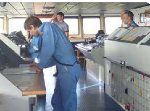
Maersk Tankers provided an opportunity for ITOPF to join them on a voyage in Europe