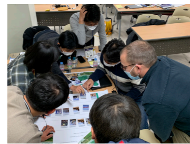
Training with the Korea Coast Guard