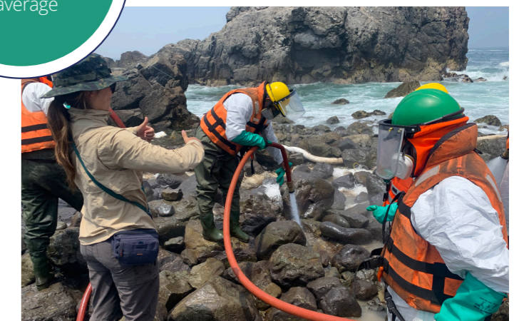
Providing advice on-site in Peru