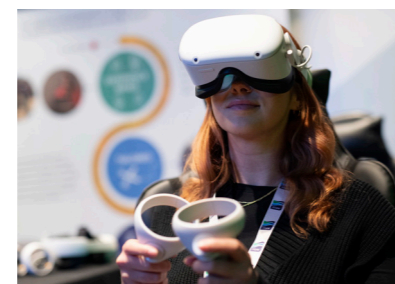
Using ITOPF's VR app on aerial surveillance

Training courses provide an excellent opportunity for us to share our technical knowledge and first-hand experience with those likely to be involved with an incident. Our training is often undertaken with key inter-governmental partners, such as IMO and the IOPC Funds, or industry bodies like IPIECA. We incorporate a number of interactive training methods and tools to suit a wide variety of audiences and learning styles. This includes interactive table-top exercises, gamified learning and virtual reality.